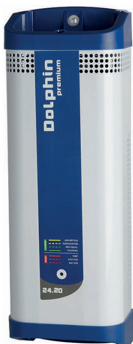
Plug and Play Battery Charger