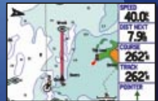
Navigating to a waypoint.

Specifications are subject to change without notice.