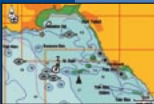
Detailed coastal data.