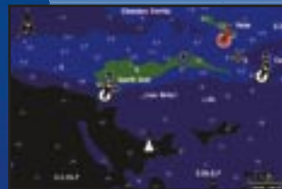
Detailed night mode.